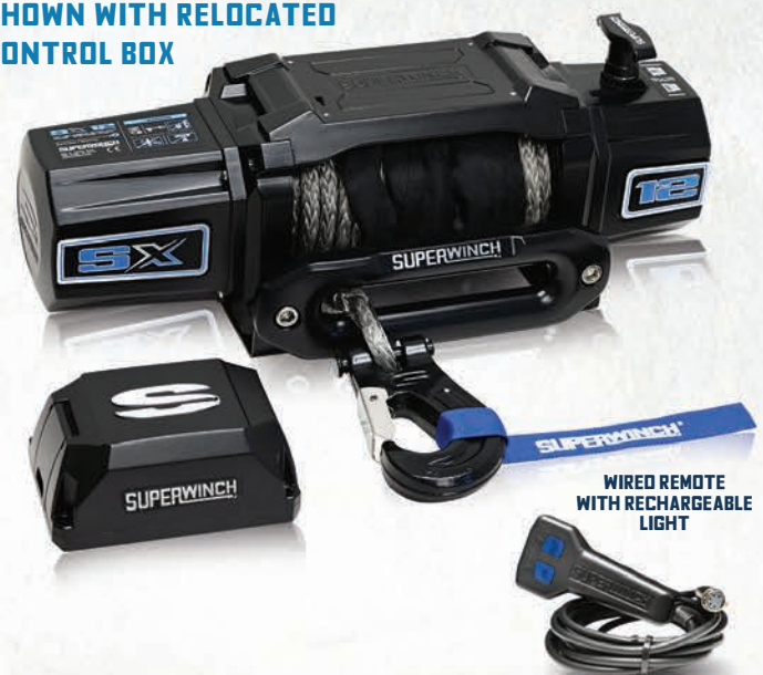
WIRED REMOTE WITH RECHARGEABLE LIGHT