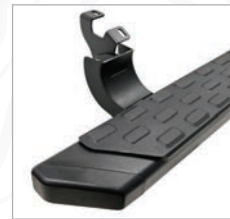
INJECTION MOLDED BRACKET COVERS INCLUDED