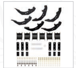
MOUNT KIT INCLUDED