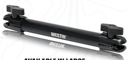
AVAILABLE IN LARGE, MEDIUM, AND SMALL SIZES (SOLD SEPARATELY)