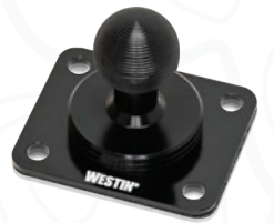
4-HOLE MOUNTING BALL BASE