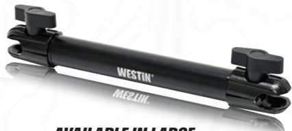
AVAILABLE IN LARGE, MEDIUM, AND SMALL SIZES (SOLD SEPARATELY)