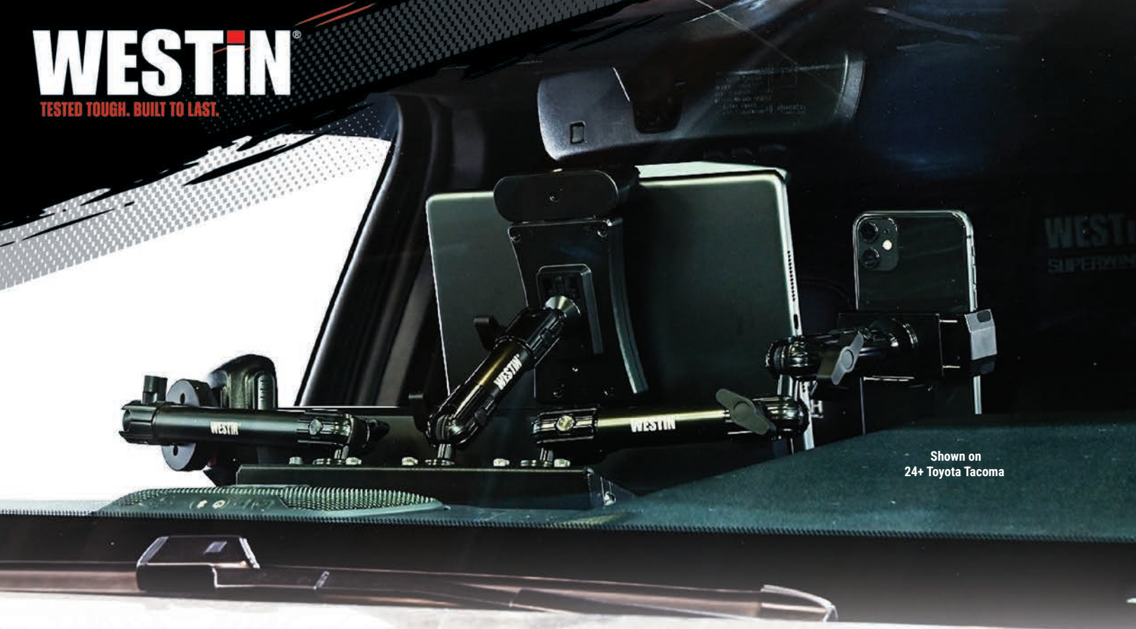
Shown on 24+ Toyota Tacoma