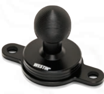
2-HOLE MOUNTING BALL BASE