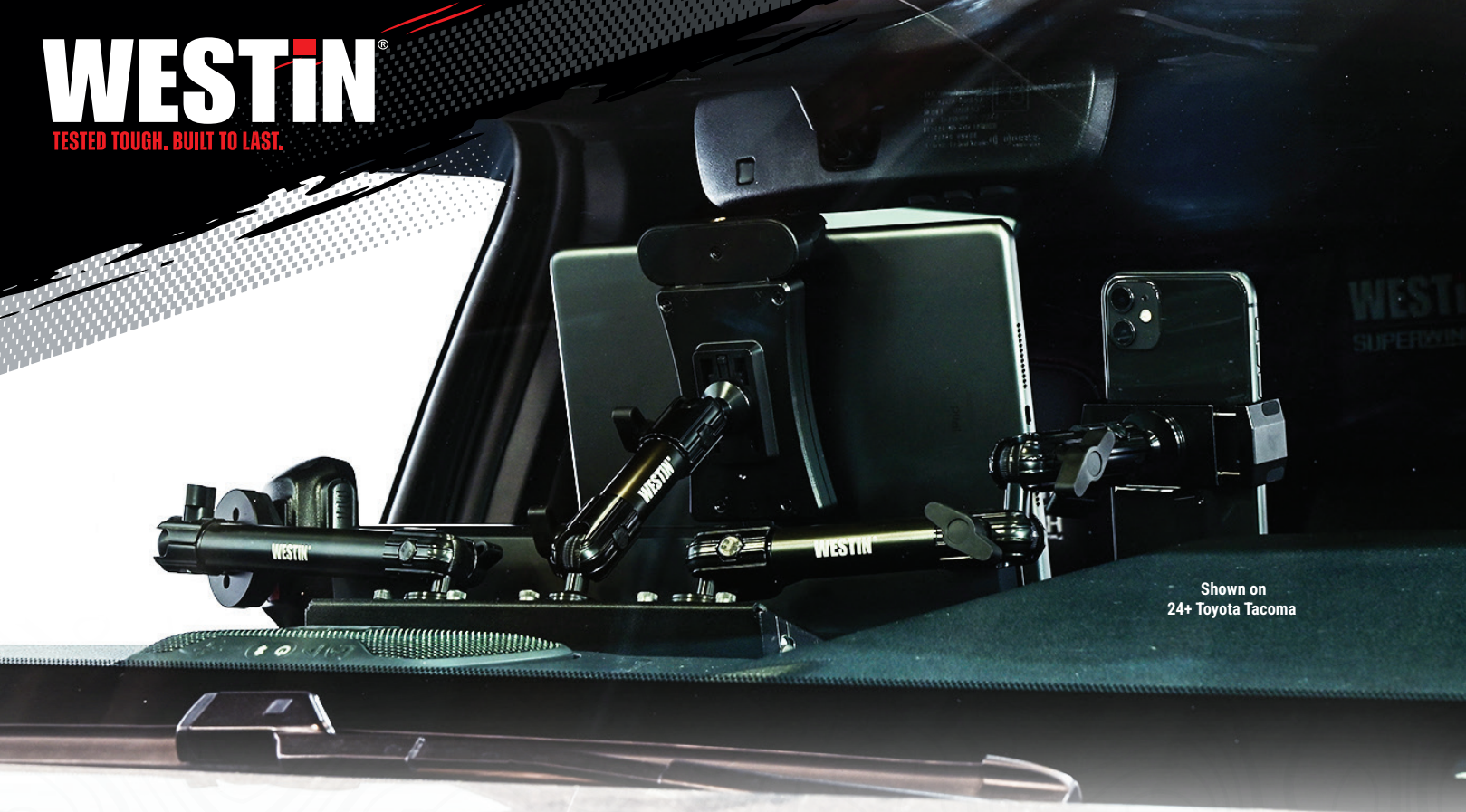
Shown on 24+ Toyota Tacoma