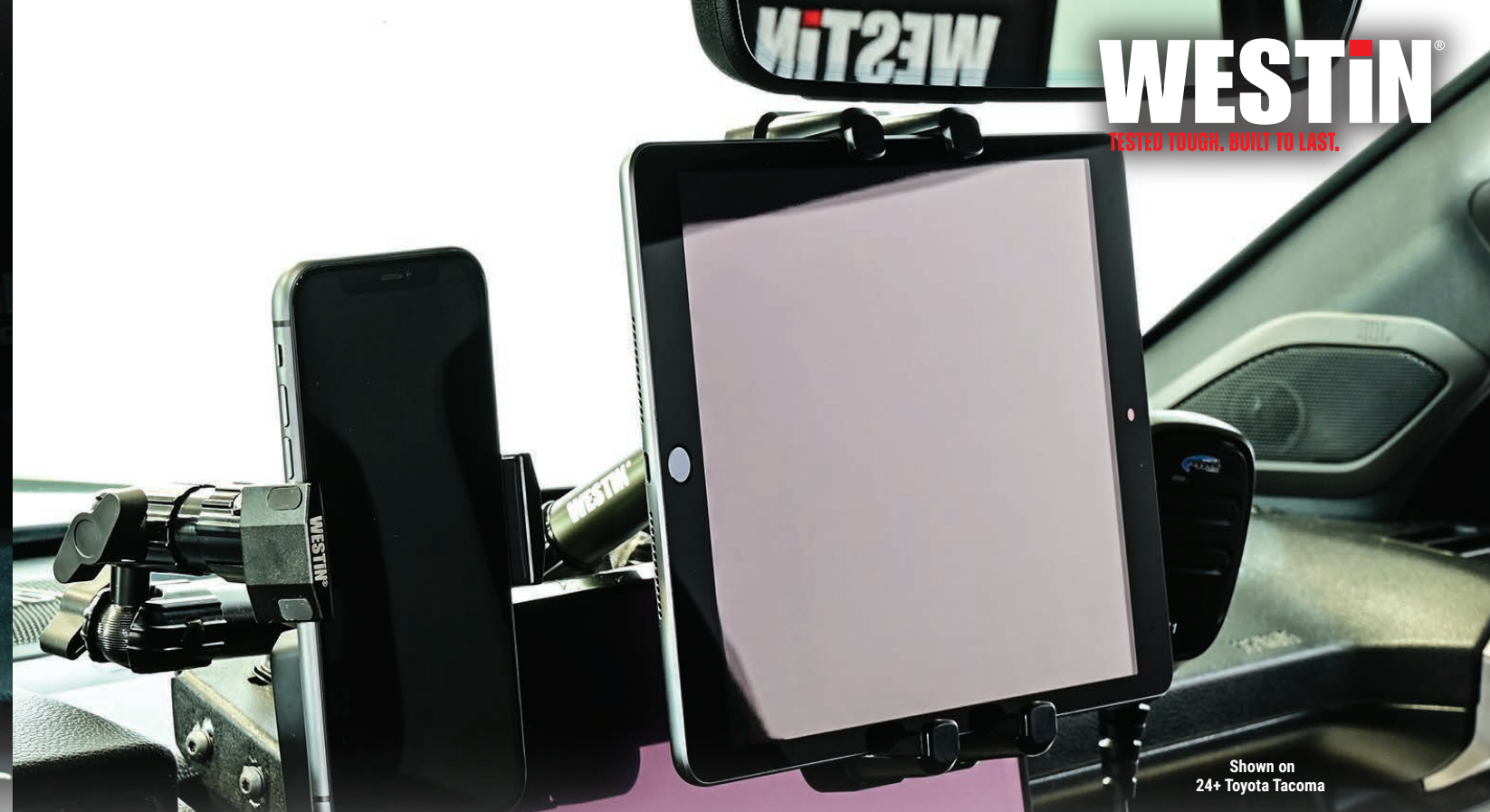
Shown on 24+ Toyota Tacoma