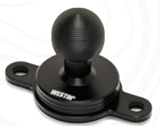
2-HOLE MOUNTING BALL BASE